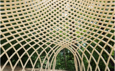
General view of the pavilion