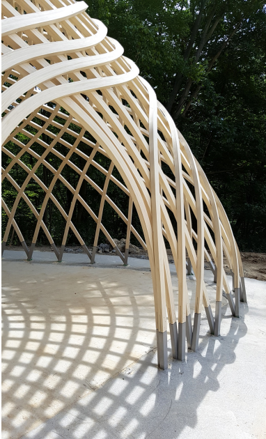
Close-up of the free-form construction