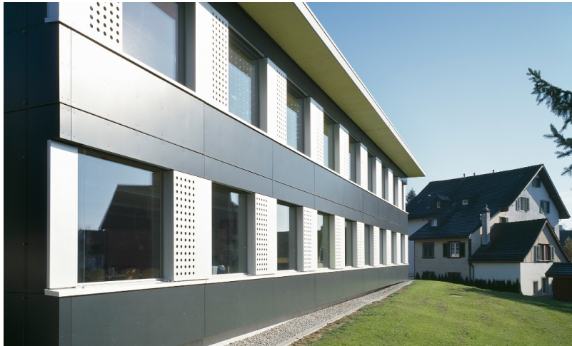
Temporary Hasenacker school building in modular design with facade in anthracite white