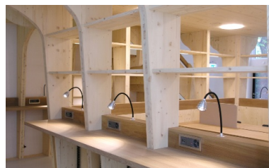
Generous space for individual study