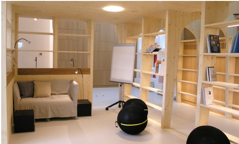
A quiet corner for individual study