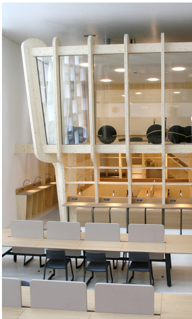
Classroom with different workstations