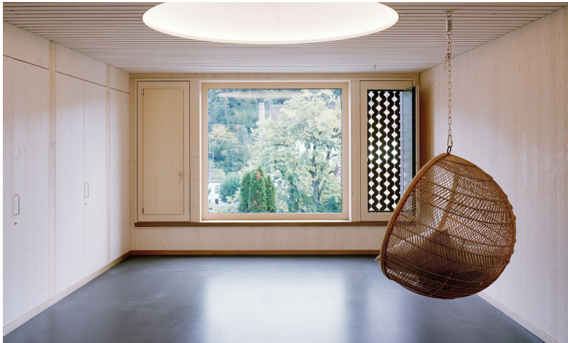
Comfortable recreational room in the residential home for deafblind people.