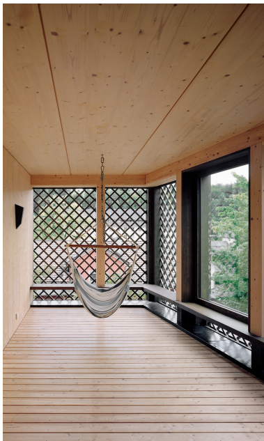
Wood also dominates the covered balcony.